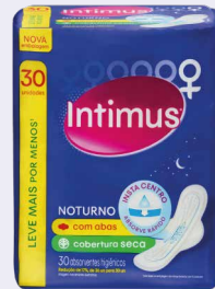
ABS INT GEL NOTURNO SECA C/AB 30UND 145458