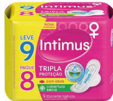
ABS INT GEL TRP PROT SUAVE C/AB 9UND