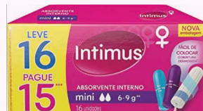
ABS INT GEL INTERNO MINI L16P15