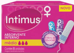
ABS INT GEL INTERNO MEDIO C/8UND