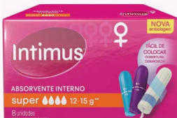
ABS INT GEL INTERNO SUPER C/8UND