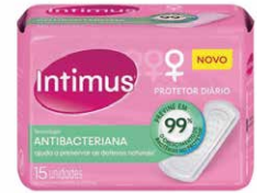
PROT DIARIO INT DAYS ANTBAC 15UND