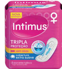
ABS INT GEL TRP PROT SUAVE S/AB 8UND