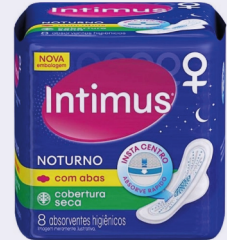
ABS INT GEL NOTURNO SECA C/AB 8UND 133228