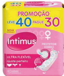
PROT DIARIO INT DAYS FLEXIVEL L40P30