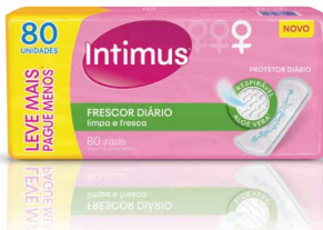
PROT DIARIO INT DAYS S/AB C/PF L80P60