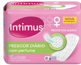
PROT DIARIO INT DAYS S/AB C/PF 15UND