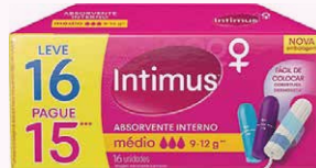
ABS INT GEL INTERNO MEDIO L16P15