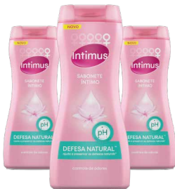
KIT SAB INT FEM DEF NATURAIS 200ML