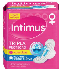
ABS INT GEL EXT TRP PROT SUAVE C/AB 8UND 133201