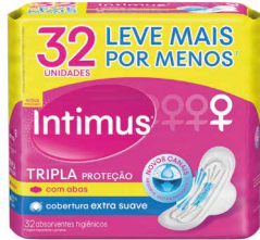
ABS INT GEL TRP PROT SUAVE C/AB 32UND