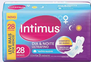
ABS INT DIA&NOITE C/ ABAS 28UND 145455