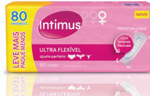
PROT DIARIO INT DAYS FLEXIVEL L80P60