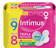
ABS INT GEL TRP PROT SECA C/AB L9P8UND 139481