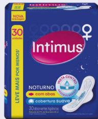
ABS INT GEL NOTURNO SUAVE C/AB 30UND 145457