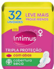
ABS INT GEL TRP PROT SECA C/AB 32UND 133223