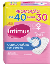
PROT DIARIO INT DAYS S/AB S/PF L40P30