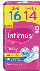
ABS INT GEL TRP PROT SUAVE C/AB L16P14