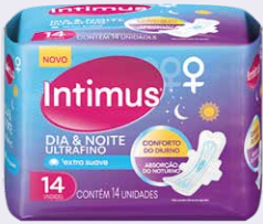
ABS INT DIA&NOITE C/ ABAS 14UND 145452