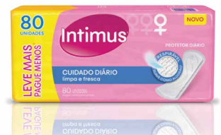
PROT DIARIO INT DAYS S/AB S/PF L80P60