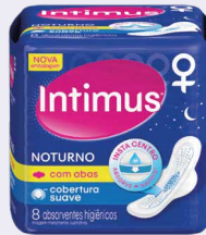
ABS INT GEL NOTURNO SUAVE C/AB 8UND 133224