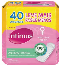
PROT DIARIO INT DAYS ANTBAC 40UND