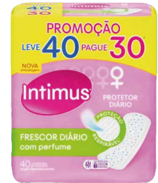
PROT DIARIO INT DAYS S/AB C/PF L40P30