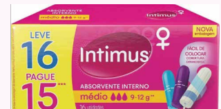
ABS INT GEL INTERNO SUPER L16P15