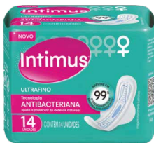
ABS INT GEL ANTIBAC C/AB 14UND 146058