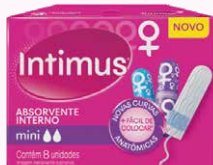
ABS INT GEL INTERNO MINI C/8UND