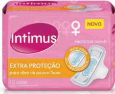
PROT DIARIO INT DAYS DAYS C/AB S/PF 15UND