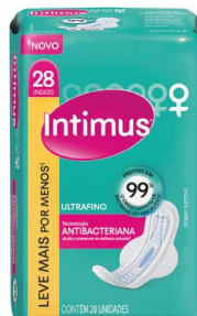
ABS INT GEL ANTIBAC C/AB 28UND 146059