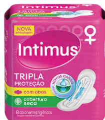
ABS INT GEL TRP PROT SECA C/AB 8UND 133230