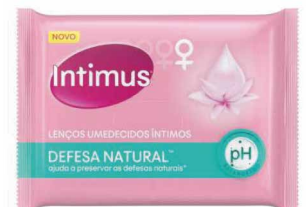
LENCO UMED INT FEM S/PERF SOFTPACK 16UND