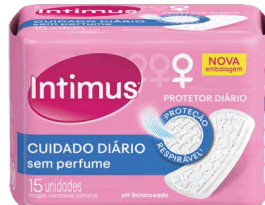
PROT DIARIO INT DAYS S/AB S/PF 15UND