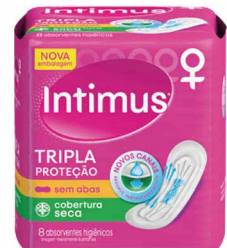
ABS INT GEL TRP SECA S/AB 8UND 133205