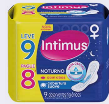
ABS INT GEL NOTURNO SUAVE C/AB LV9 PG8 133232